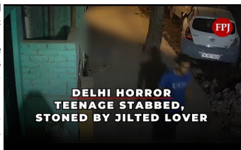
DELHI HORROR TEENAGE STABBED, STONED BY JILTED LOVER